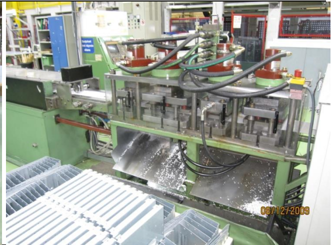
Hydraulic puncturing unit (Samesor)