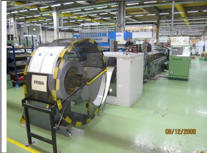
Decoiler 2 tn , strip width max 400 mm (Camu)