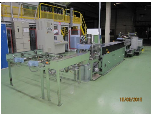
Rollforming line with receiving unit (Samesor)